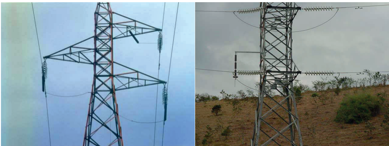
Figure 4 – Line arresters installed on 138 kV lines: Left – CEMIG / Right - UTEJF

The analysis and evaluation of the Brazilian's overhead line lightning performance expressed as the average number of outages per a hundred kilometers a year before and after the line arresters