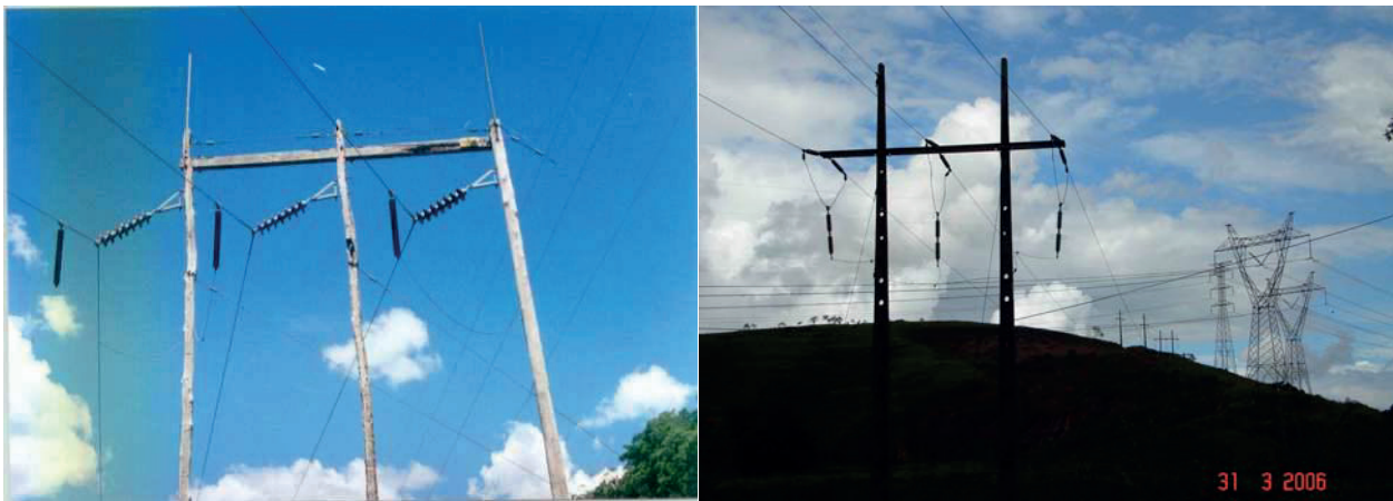
Figure 3 – Line arresters installed on 69 kV lines: Left CEMIG / Right Ampla