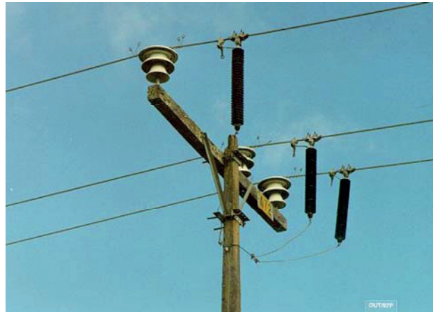
Figure 2 – Line arresters installed on 34.5 kV line – CEMIG [1]

technical and economical point of view, lightning performance estimate studies have usually been performed to select the appropriate line arresters characteristics and to optimize the quantity and location of the line arresters along the more critical sections of the overhead lines [14-18].