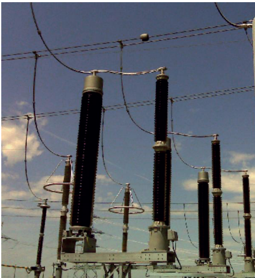
Figure 1 – Simultaneous work of capacitor and inductive voltage transformers in a 400/110 kV substation

Voltage, current and phase angle are the input signals of the electricity meter. In expressions (1) and (2) they actually define active and reactive power brought to the meter at any time. Uncertainties of voltage, current and phase angle are linked to voltage and current transformers and secondary lines. These are then the sources of uncertainties for active and reactive power as well. Active and reactive energies are read directly from the meter. The meter, therefore, directly contributes to the uncertainty of energy measurement. The uncertainty of time is a part of the overall uncertainty of the meter. The total uncertainty of active and reactive energy consist of the uncertainty of the meter and the uncertainty of the input signal, active or reactive power, brought to the meter.